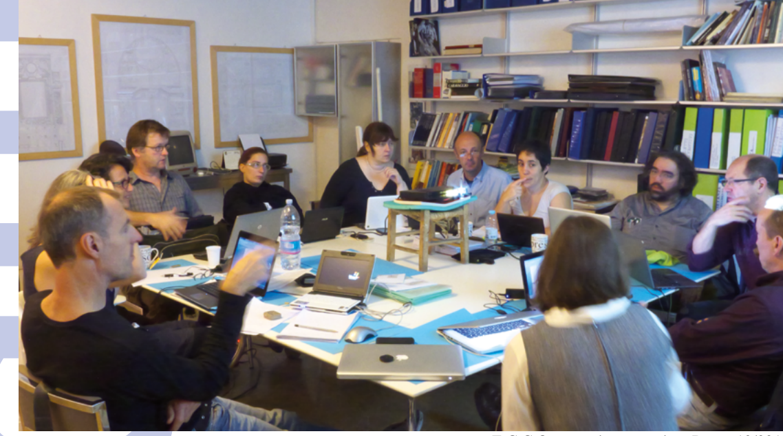
E.C.C.O. committee meeting, Rome 10/2013