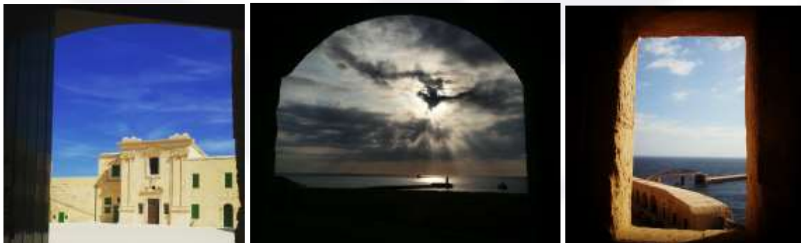
Figure 3: Different perspectives of the Forte: the Parade ground, a view of the break water from the entrance vault and a view of the break water from one window with the 'gardiola' (corner guard post).