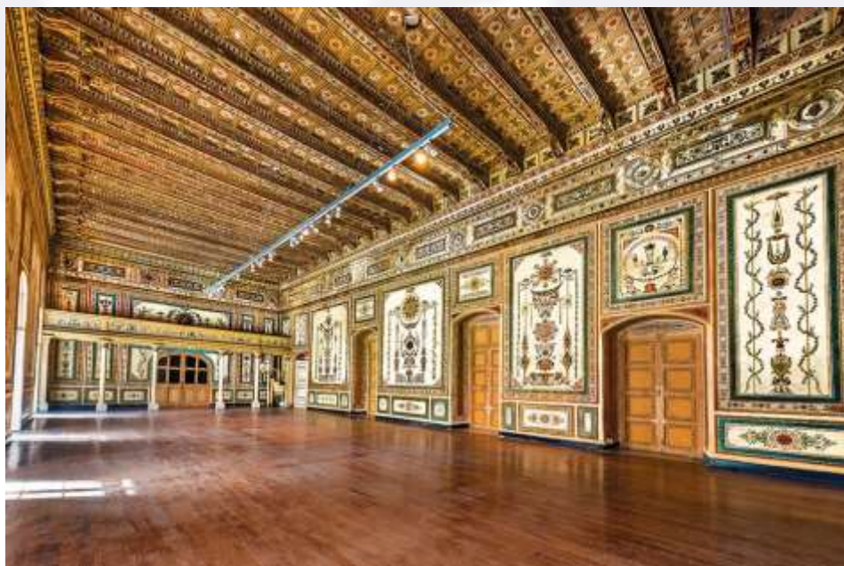
Figure 5: The Grand Salon currently being conserved