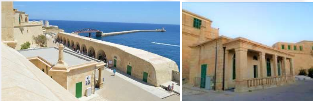
Figure 2: The hall with the chimney will be hosting the General Assembly