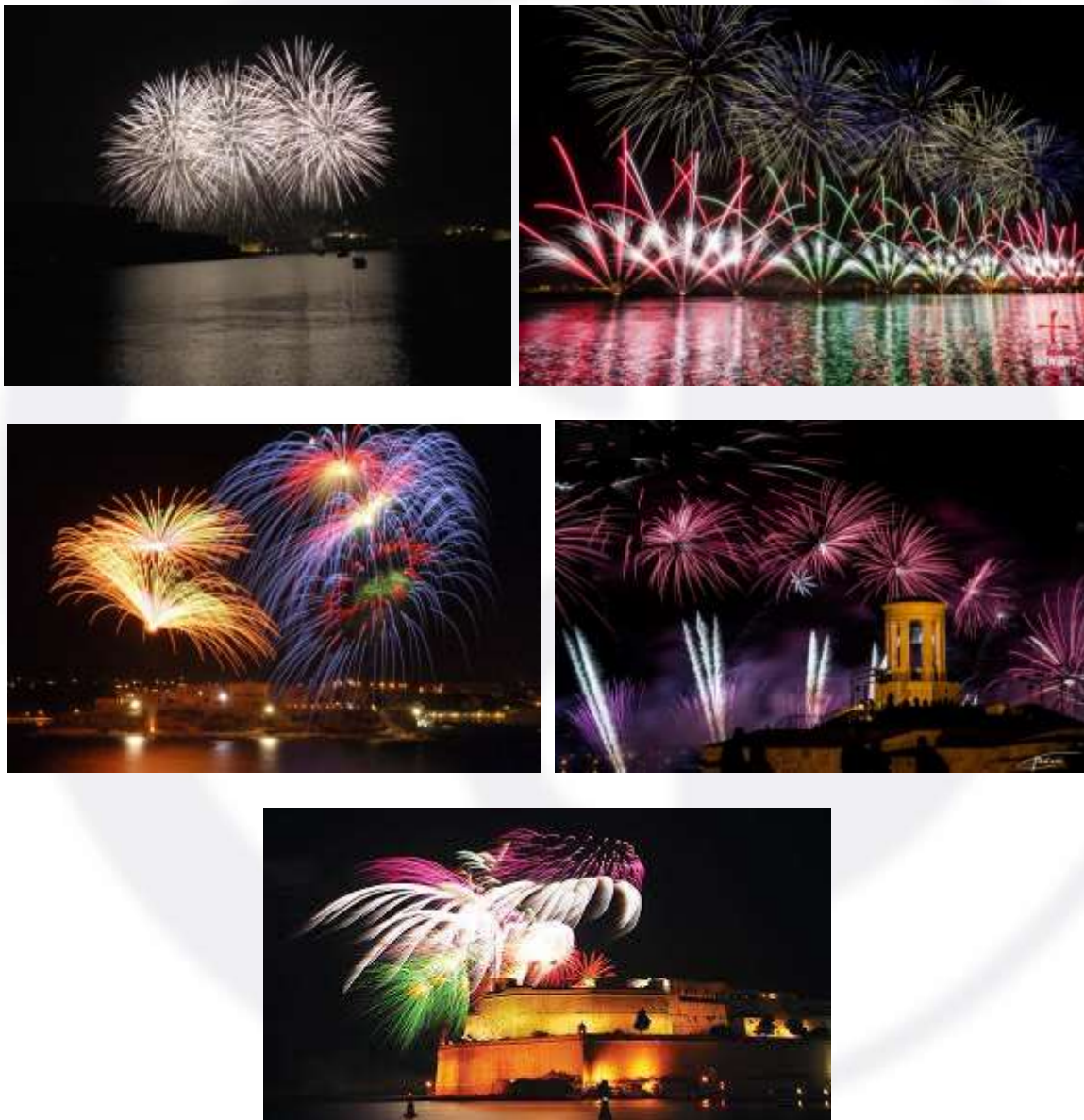
Figure 6: Some photographs retrieved from the internet

This will be held at Fort St Elmo on Monday 30 th April 2018. Finger foods and drinks will be provided. Weather permitting the guests will be entertained by a spectacular display of pyrotechnics (fireworks) over the grand Harbour, as the final evening of the Fireworks festive 2018. The following day, 1 st May is a public holiday in Malta, in which the locals celebrate Workers' Day as well as commemorating the anniversary of Malta becoming a full members of the European Union.