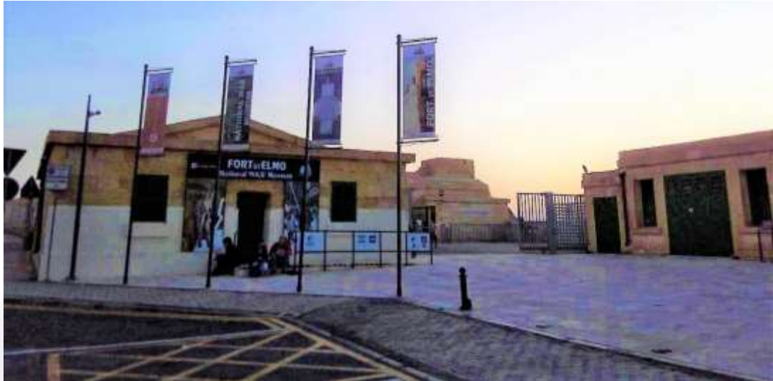
Figure 1: A general picture of the public entrance to the venue