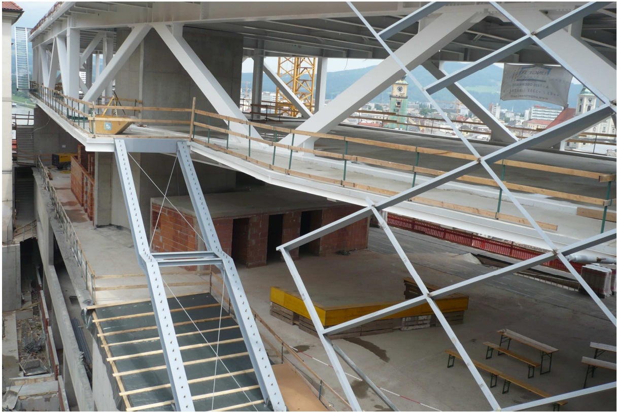
8: Main stair construction connecting level 1 and level 2 (Technology Upper Austria space) – structural works