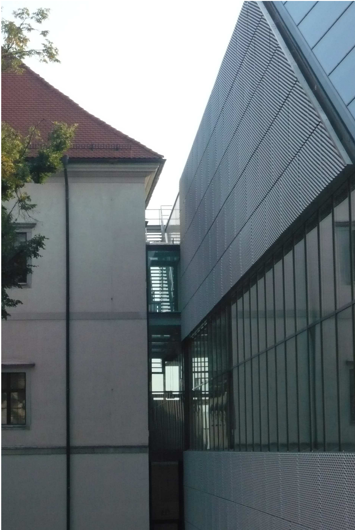
4: Connections South-Wing – East-Wing at level 1 and 2