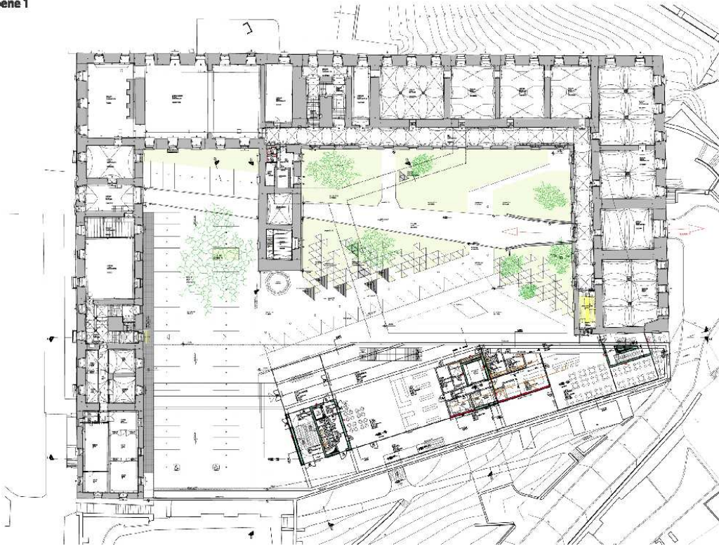
6: Floorplan level 1: Entrance/Foyer/Shop/Restaurant – permanent exhibition rooms in the Castle-Wings