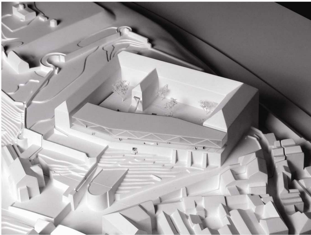
2: Linz Castle Museum "South-Wing": Model of the Winner Project, HoG-architektur