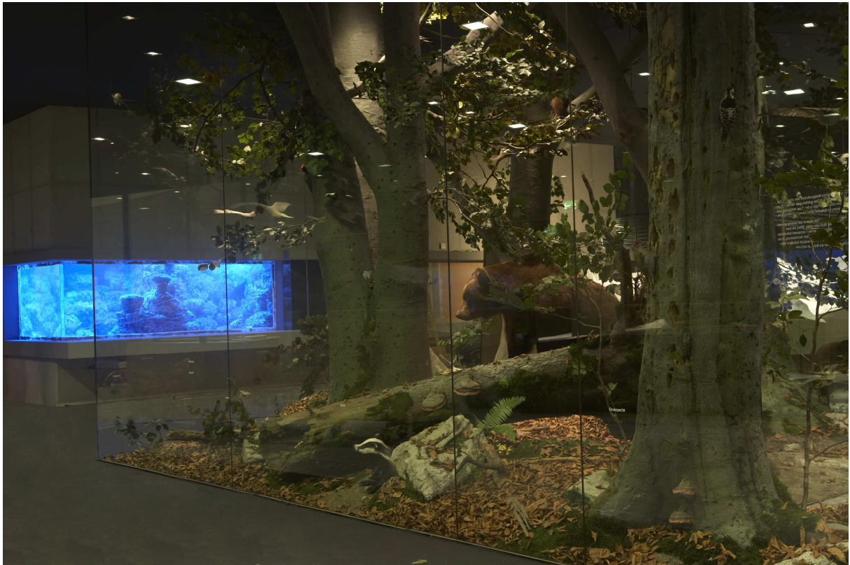
11: "Nature Upper Austria", the exhibition