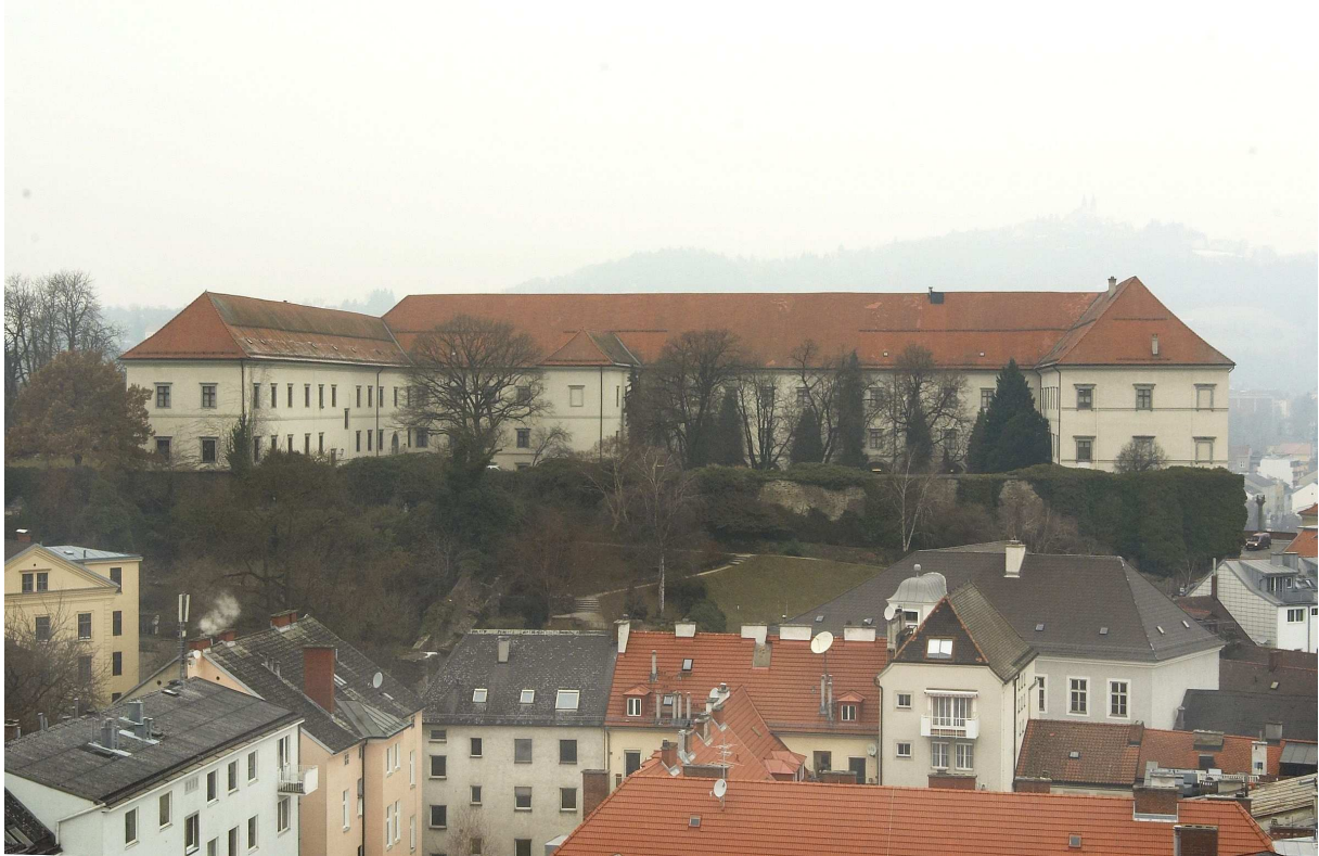
1: Linz Castle from South in 2006