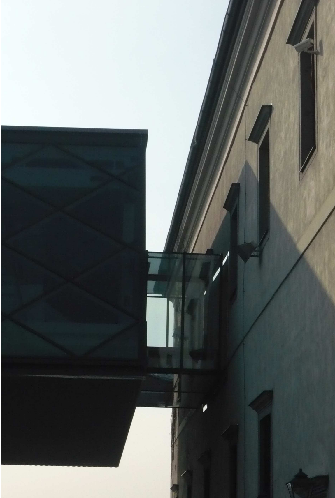
5: Connection South-Wing – West-Wing at level 2