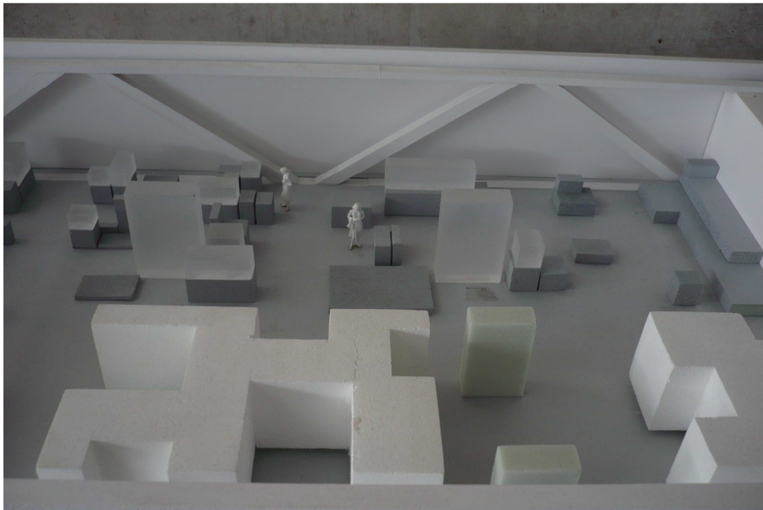
9: "Technology Upper Austria" – western section, model (concept and model: argeMarie)