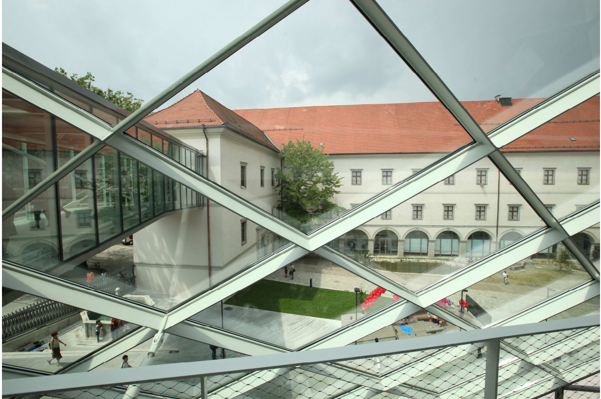
3: The Bridge – 21 st century meets historical castle