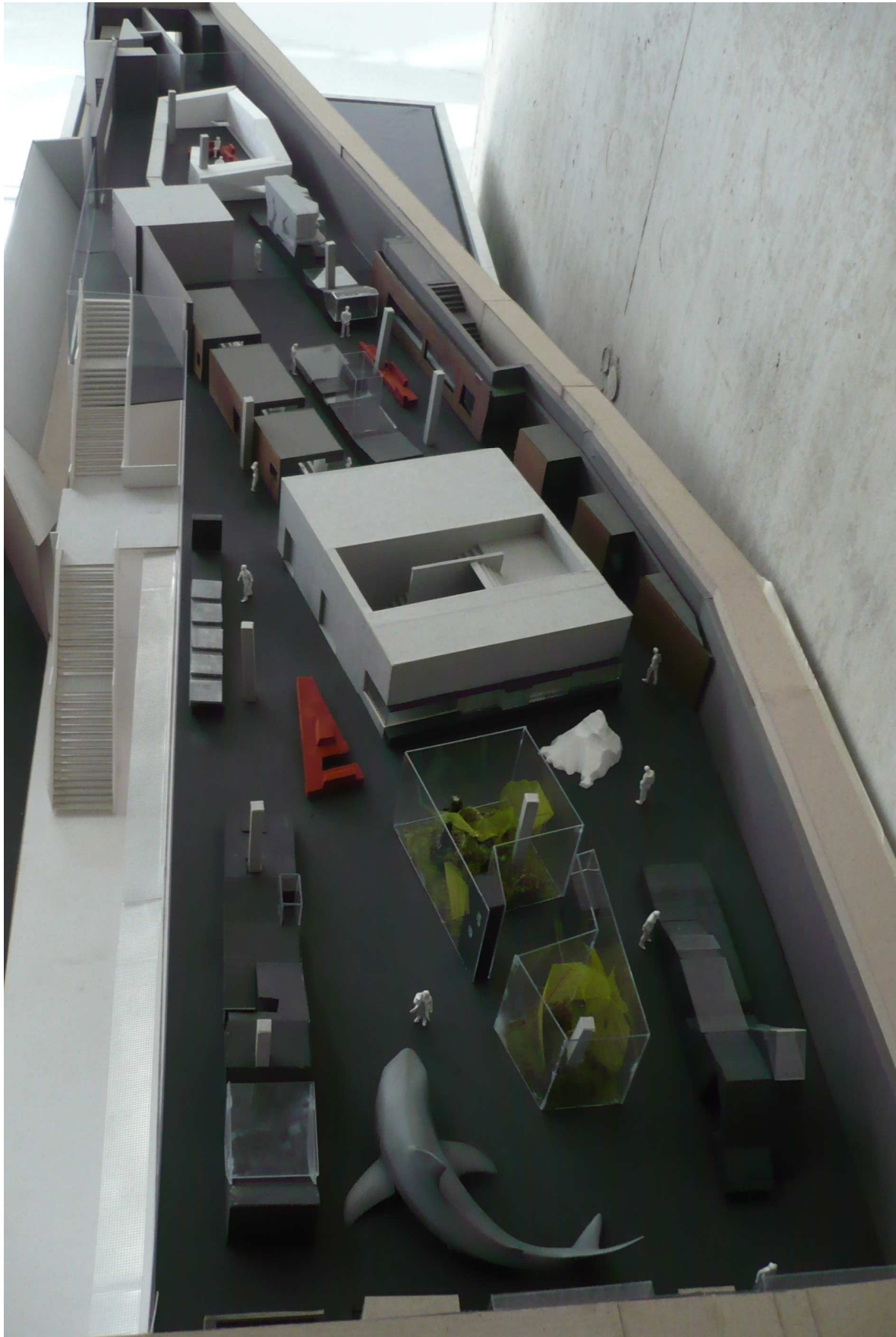
10: "Nature Upper Austria", model (concept and model: argeMarie)